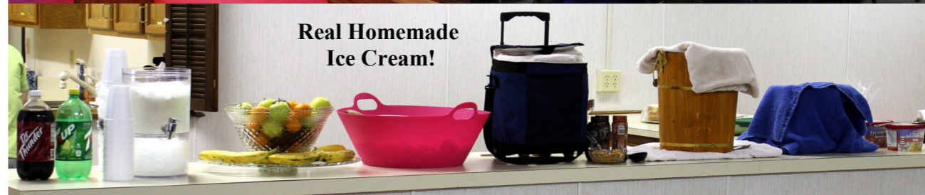
Real Homemade Ice Cream!