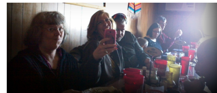
The Valentine Banquet at Buena Vista Grill!