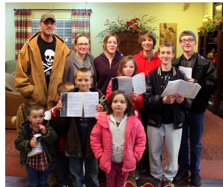
Christmas Caroling & Santa Claus