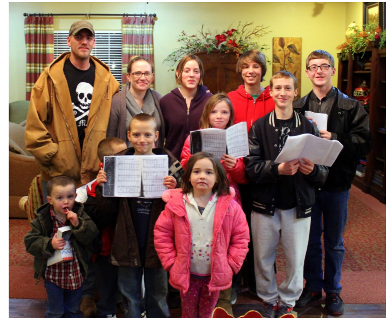
Christmas Caroling & Santa Claus