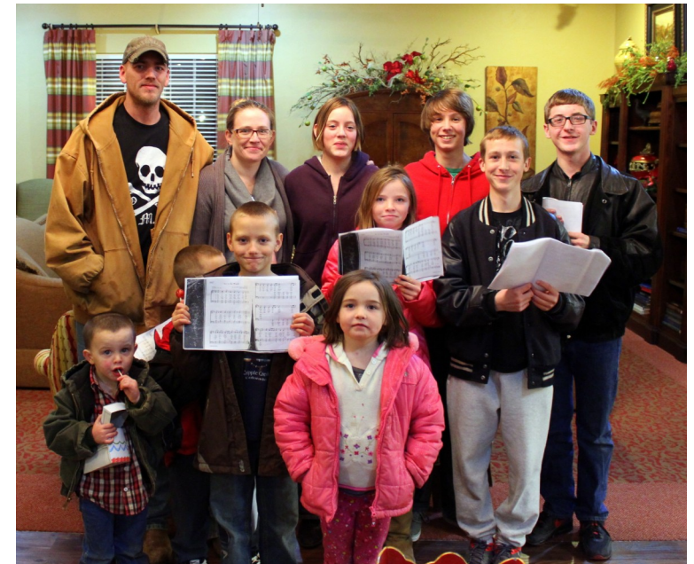
Christmas Caroling & Santa Claus