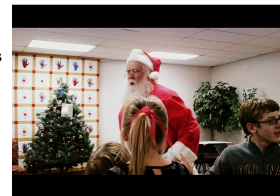
"A Birthday Party for Jesus"